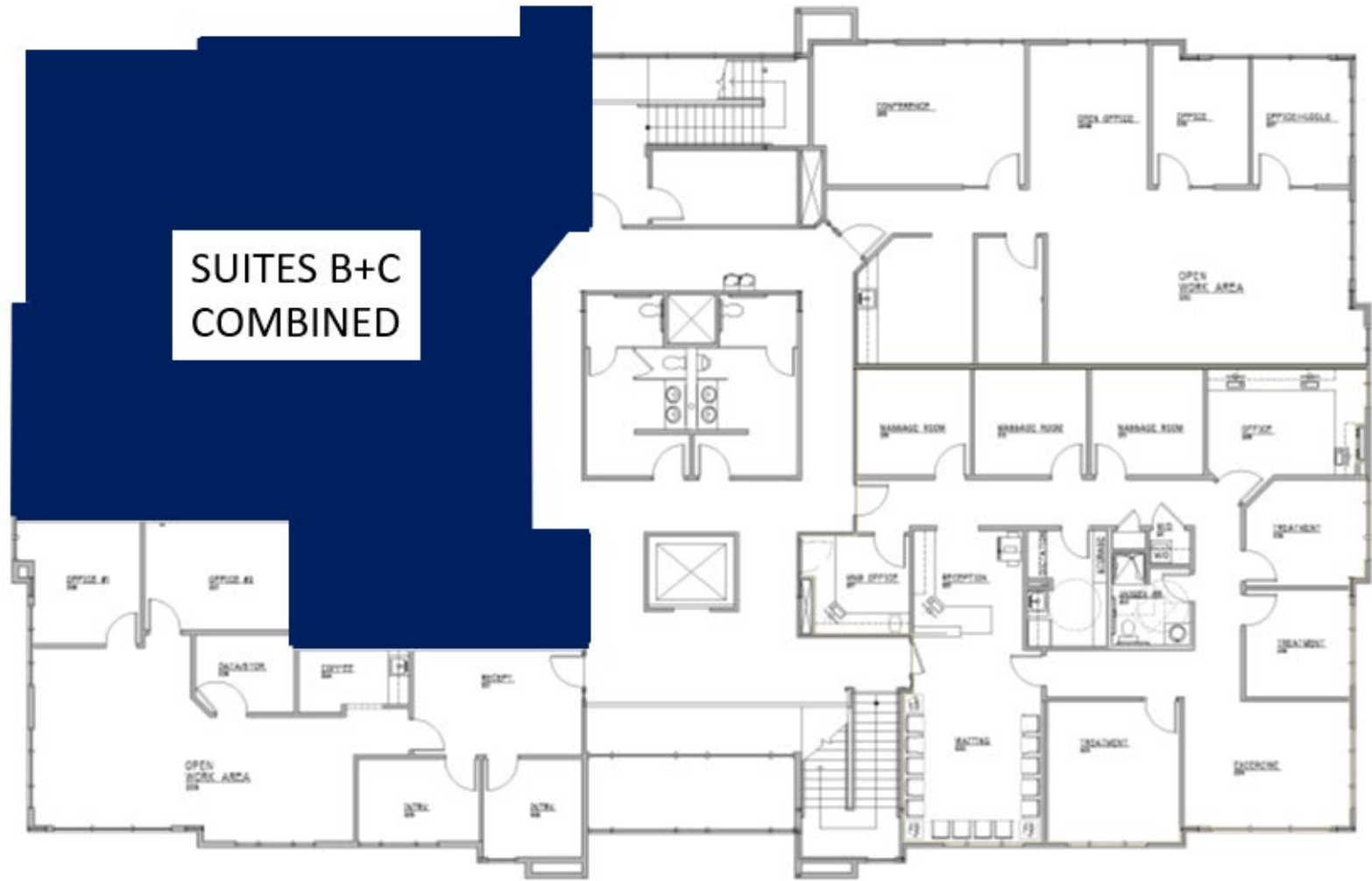
SECOND FLOOR PLAN 1/4" = 1'-0" 2/28/16

No warranty or representation, expressed or implied, is made as to the accuracy of information contained herein, and same is submitted subject to errors, omission, change of price, rental or other conditions and withdrawal without notice. Purchaser and his/her agent are responsible for independently verifying all presented information.