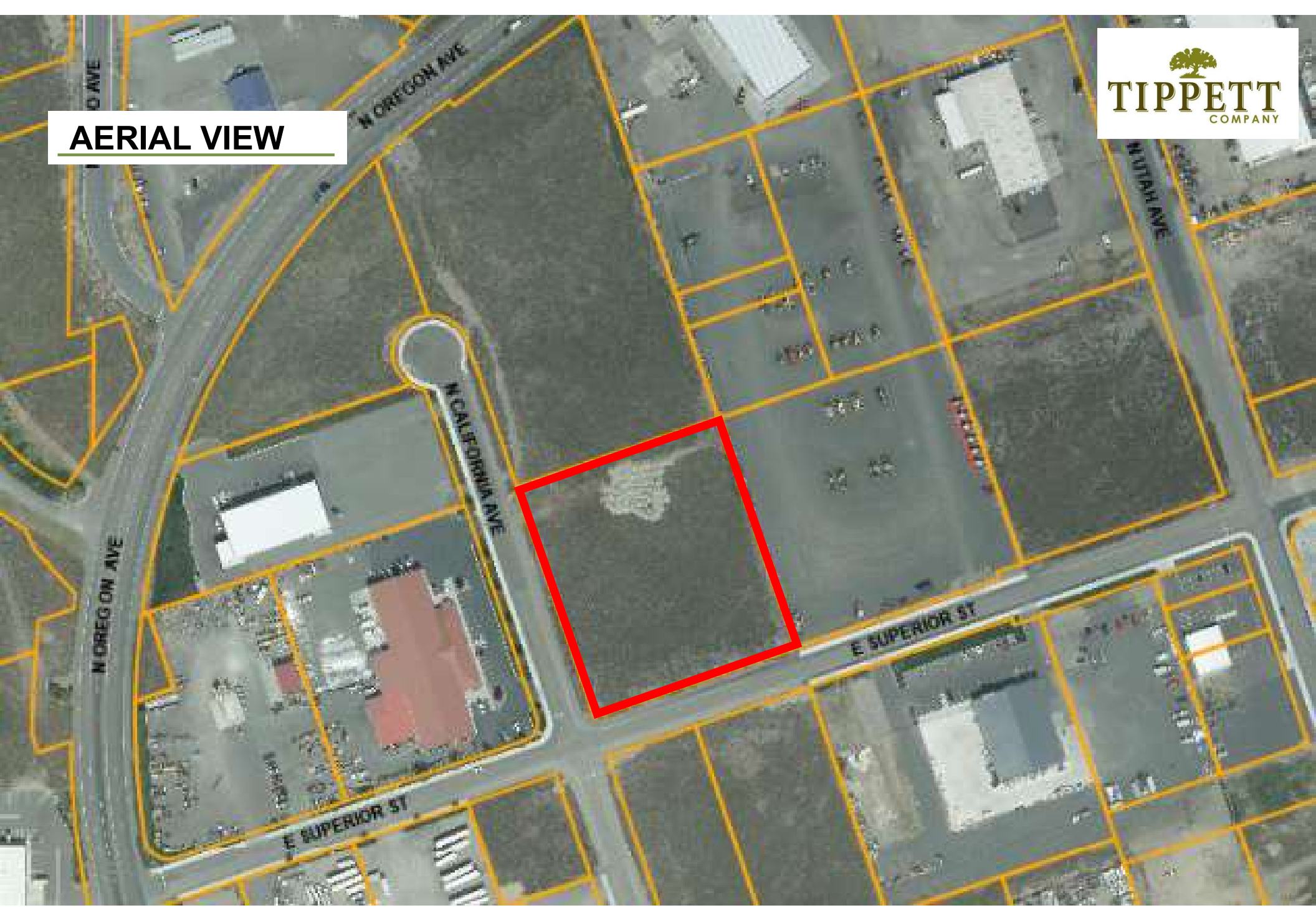
No warranty or representation, expressed or implied, is made as to the accuracy of information contained herein, and same is submitted subject to errors, omission, change of price, rental or other conditions and withdrawal without notice. Purchaser and his/her agent are responsible for independently verifying all presented information.